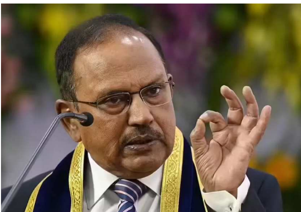
THE KASHMIR TALK BUREAU CHENNAI:

India smashed nine terror targets with precision, crisscrossing Pakistan, under Operation Sindoor, National Security Advisor Ajit Doval said here on Friday and dared the foreign media to show "even one image" of damage to