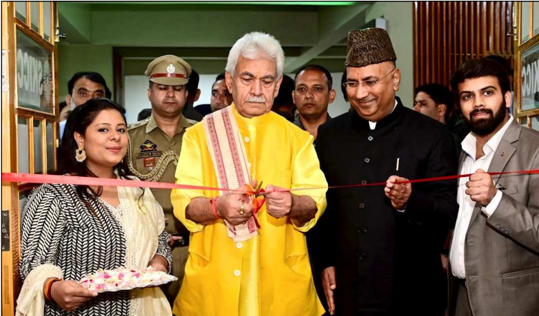
THE KASHMIR TALK BUREAU SRINAGAR:

Lieutenant Governor Manoj Sinha today inaugurated 'Bharat Sanrachna J&K 2025' exhibition and public outreach initiative at Srinagar.