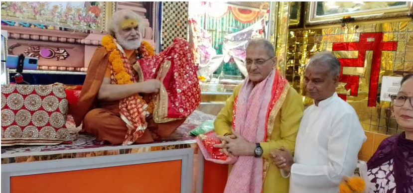
THE KASHMIR TALK BUREAU JAMMU:

Emphasizes Role of Saints in Nation Building