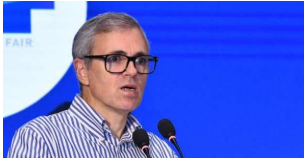
THE KASHMIR TALK BUREAU KOLKATA:

Chief Minister Omar Abdullah on Thursday said there is a renewed sense of optimism surrounding the revival of tourism in the state, following the Pahalgam terror attack that left 26 people dead.