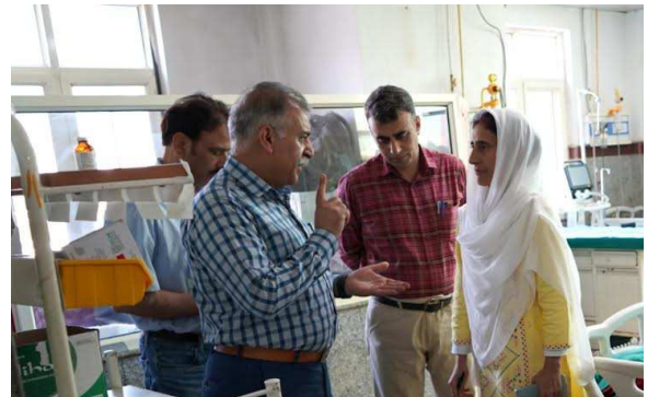
THE KASHMIR TALK BUREAU BANDIPORA:

Says no compromise on professionalism and accountability in healthcare