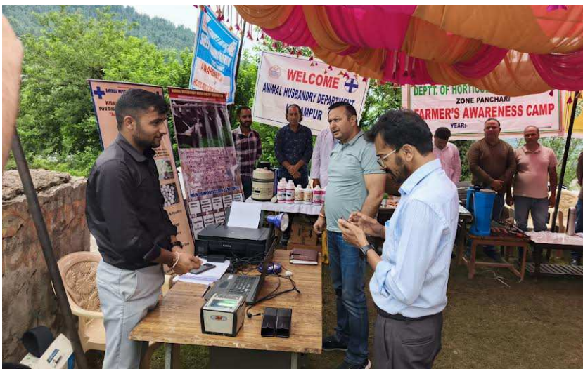
THE KASHMIR TALK BUREAU UDHAMPUR:

A vibrant awareness and benefit saturation camp under the Dharti Aaba Janjatiya Gram Utkarsh Abhiyan (DAJGUA) was successfully organized at Panchayat Latyar Block Panchari in Udhampur district, under the supervision of the Assistant Commissioner Revenue