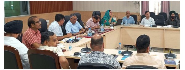
THE KASHMIR TALK BUREAU SAMBA:

In a significant move to strengthen grassroots governance and fast-track local development in line with national priorities, the Department of Rural Development and Panchayati Raj (RD&PR), Jammu & Kashmir conducted a one-day district-level workshop on the Panchayat Advancement Index (PAI) in Samba. Presided over by Deputy Commissioner, Samba Rajesh Sharma, the workshop aimed to sensitize and train government officers on the crucial role of PAI in assessing and accelerating development at the village level. The event saw participation from Assistant Commissioner Panchayat (ACP) Samba, N.D. Verma, officials from the RD&PR Department and representatives from key line departments involved in rural development. The workshop's central theme was translating global goals into actionable strategies at the local level.