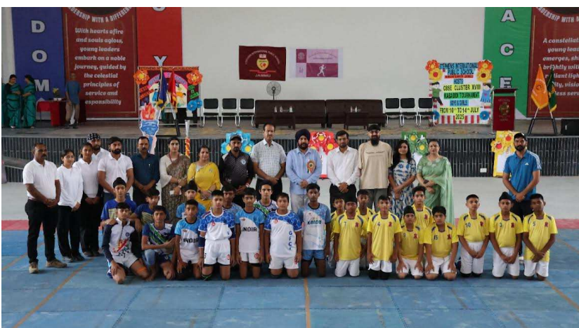
THE KASHMIR TALK BUREAU JAMMU:

Stephens International Public School (SIPS) hosted the esteemed CBSE Cluster XVIII Kabaddi Tournament 2025 with palpable enthusiasm and vigour.