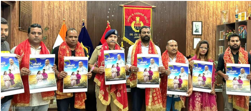
THE KASHMIR TALK BUREAU JAMMU: