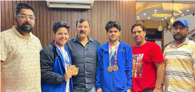
THE KASHMIR TALK BUREAU JAMMU:

Says sports play a pivotal role in shaping character, discipline, sense of responsibility among younger generation