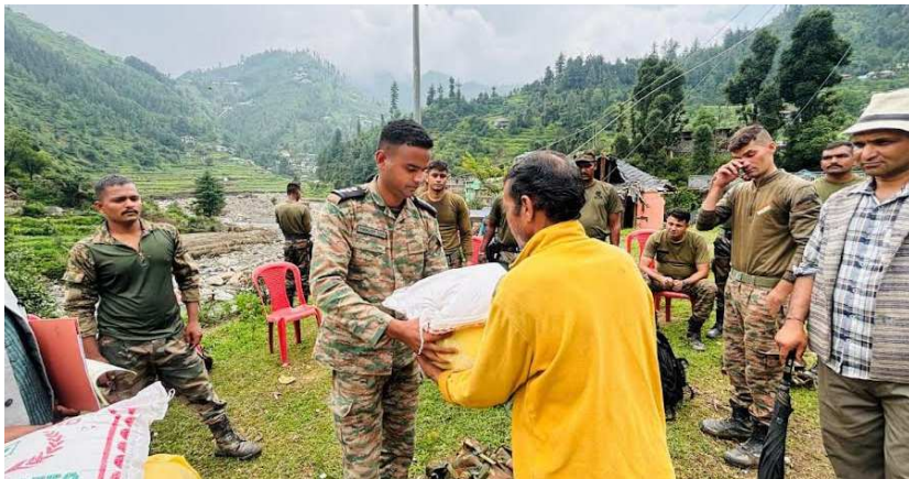
THE KASHMIR TALK BUREAU MANDI:

The Indian Army continues to extend critical support to civil administration in Himachal Pradesh as part of ongoing Humanitarian Assistance and Disaster Relief (HADR) operations, following the recent floods in Mandi district. In close coordination with the State Disaster Response Force (SDRF), National Disaster Response Force (NDRF), and local authorities, the Indian Army has deployed dedicated relief columns.