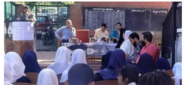
THE KASHMIR TALK BUREAU SRINAGAR:

District Legal Services Authority (DLSA), Srinagar, in collaboration with School Education department conducted an awareness programme on Protection of Children from Sexual Offences (POCSO) Act, and drug abuse at Govt. Girls High School Chaterhama Srinagar.