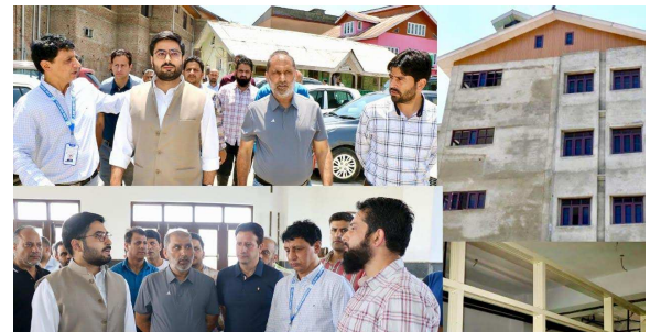
THE KASHMIR TALK BUREAU SRINAGAR:

Also inspects work progress on construction of DIPH Lab, functioning of new parking space at health facility